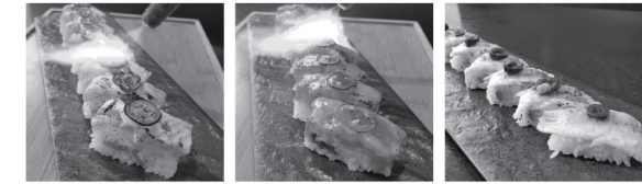
Salmon Spicy Tuna Ebi